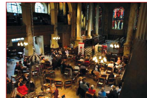
The Convention in Birmingham Cathedral

EfM has remained small in the UK, probably because it is attractive to only a minority of people. Few have the time to commit to such an extensive programme of study and many still are unaware of our resources to the church. Yet there is a growing need among some Christians who have been nurtured to conform, to ask the challenging questions that can sometimes bewilder themselves, let alone others!